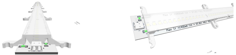
Image 1. Assembly